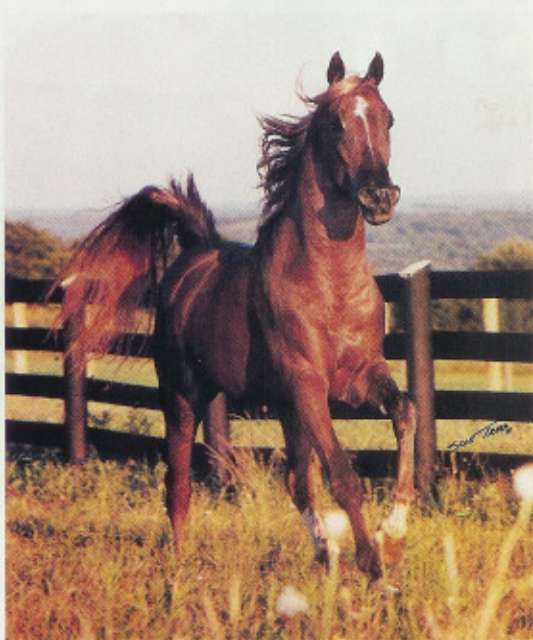
*Pauk (Mag x Pautinka).